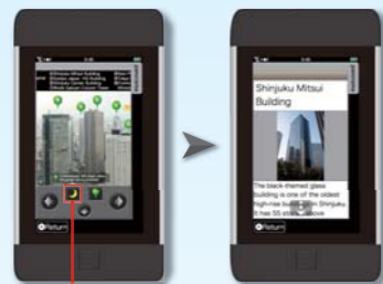
Night scenery mode

You can switch the screen to the Night scenery mode by pressing the Moon mark [ > ] .